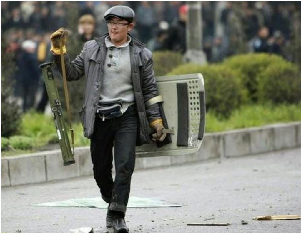
kyrgyzstan badass of the week; badass RPG guy